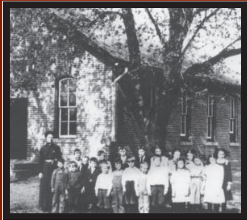
Indian Lake School, ca.1911

Few of the original historic structures exist today. In some cases, our only reminder is a small marker on the side of the road or the crumbling remnants of an old bridge. This book is an attempt to preserve the rich history of the Red Jacket Valley, one of many historical regions of Minnesota's vast heritage.